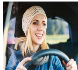
drive her car